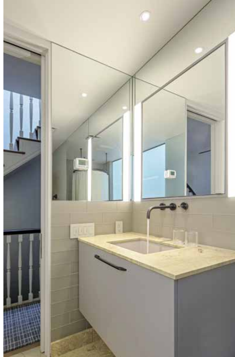
For the guest bath on the upper floor, Sahara marble with a leather textured finish was chosen for the floor, vanity top and tub.