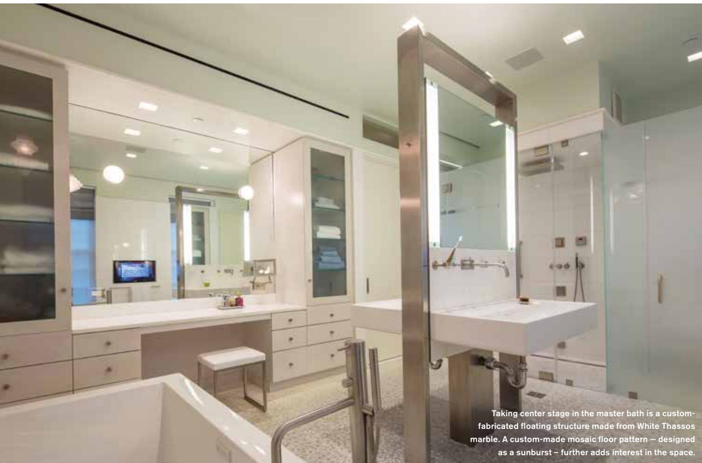
Taking center stage in the master bath is a custom-fabricated floating structure made from White Thassos marble. A custom-made mosaic floor pattern – designed as a sunburst – further adds interest in the space.