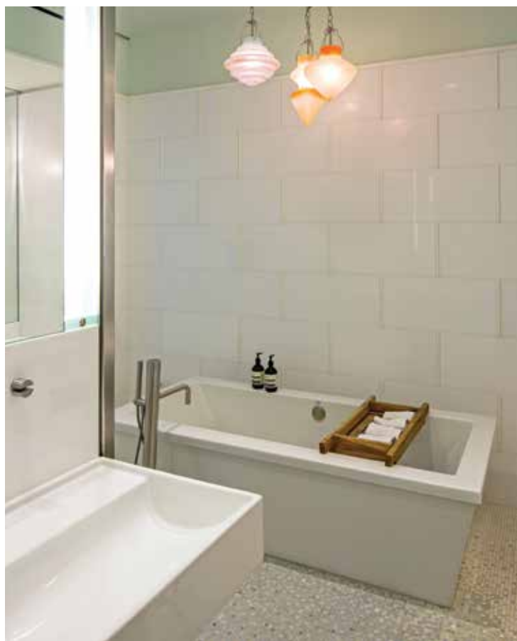
The walls in the tub and shower areas also feature White Thassos marble in a 12- x 24-inch format. “We used a White Thassos liner as a vertical element to create a pattern on the wall,” said architect Charles Rabinovitch of Charles Rabinovitch Architects in Riverdale, NY.

A central point of the interior design is the spacious kitchen, with glass doors allowing the room to extend out to the outdoor rear garden. Large-format marble pavers create a seamless transition from the front entry through the hallway and into the kitchen. The darker tones of the 2- x 3-foot floor tiles, which were custom fabricated, contrast nicely with the White Calacatta Gold countertops.